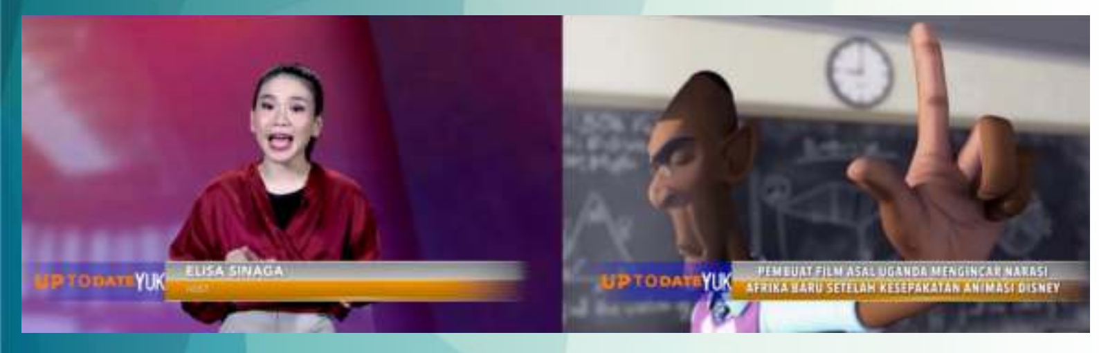
A lifestyle program that provides information about lifestyle,fashion,music,culinary, and urban life, worldwide.