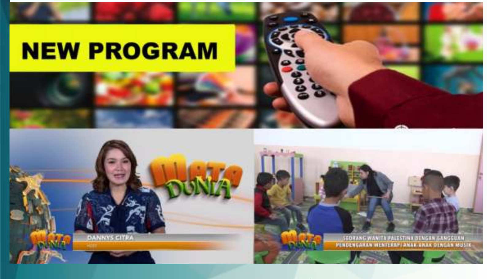
The human interest program reviews the lives of inspiring people from abroad.