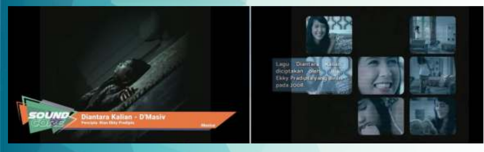
A music program that covers hits from all genres and discusses information about unfamiliarsongs, lyrics, or composers.